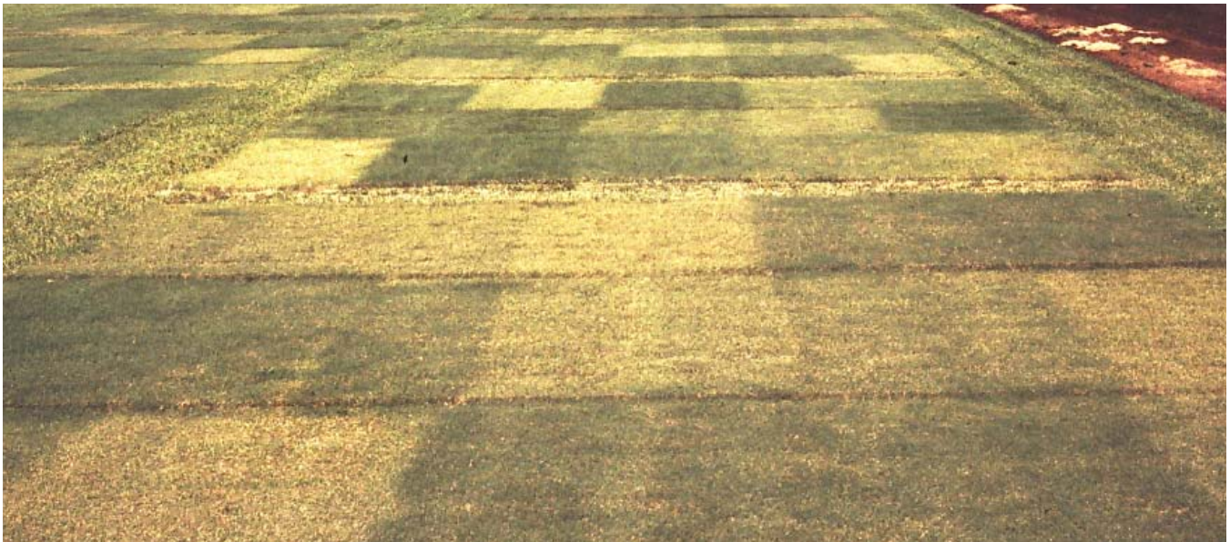
Buffalograss management research plots at the Kansas site at four weeks after the second fertilizer application in 1996 (top) and buffalograss management research plots at the Nebraska site in 1998 (bottom) showing differential response to different nitrogen applications.

applications became more evident. This may explain previous observations that buffalograss is unresponsive to nitrogen applications. If our research had been conducted for only one year, it is likely we would have drawn the same conclusion.